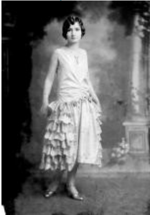
A Lady in the 1920's

http://3.bp.blogspot.com/_jwkeSCKCqE/SdLd1_lzKbI/AAAAAAAAAZM/3QexxkyM6mI/s400/Flappers2001230258.jpg January 19th 2010